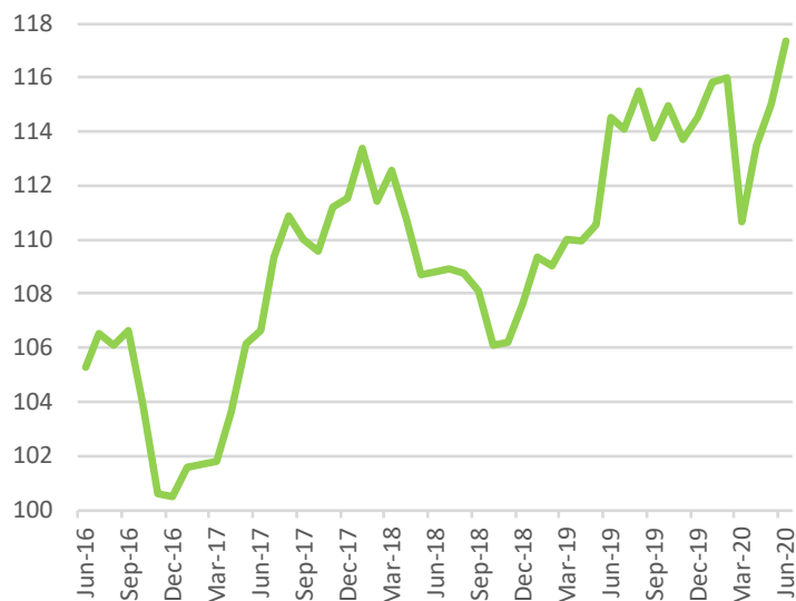
Historical Index Values - USD Unhedged