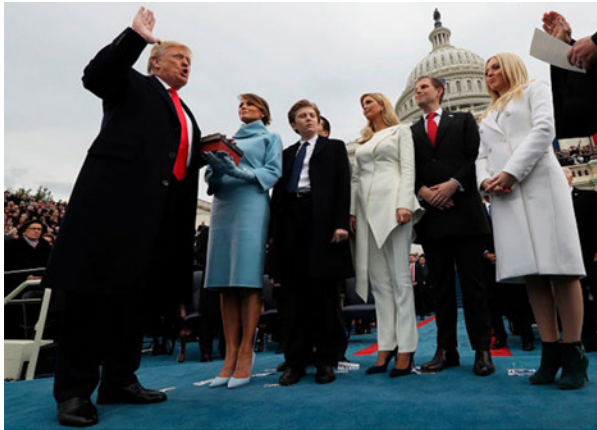
Jan. 20, 2017: Trump takes an oath to support the Constitution