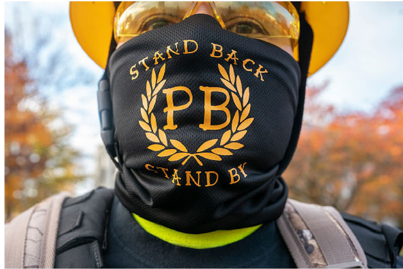
Nov. 7, 2020: Proud Boy wears a “stand back stand by” facemask

67. The Proud Boys quickly embraced Trump’s “stand back and stand by” directive as a slogan and started selling merchandise with it that same night. Jan. 6th Report at 508. Tarrio, Biggs, and two other Proud Boys leaders were later convicted of seditious conspiracy to oppose by force the lawful transfer of presidential power on January 6th. 49