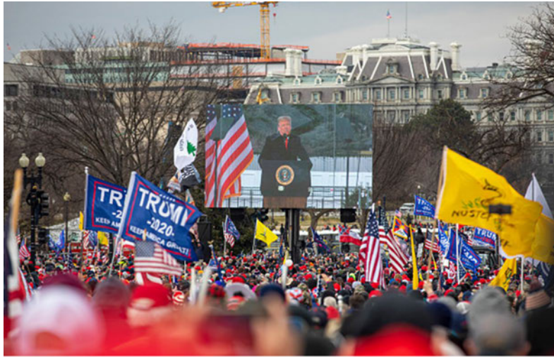
Trump addresses tens of thousands of supporters before directing them to the Capitol

280. Trump’s statements had the intended effect of producing substantial anger against Vice President Pence—anger the mob acted on that day. Jan. 6th Report at 37. During Trump’s speech, rallygoers could be heard shouting “storm the Capitol!” “invade the Capitol building!” and “take the Capitol!” 163