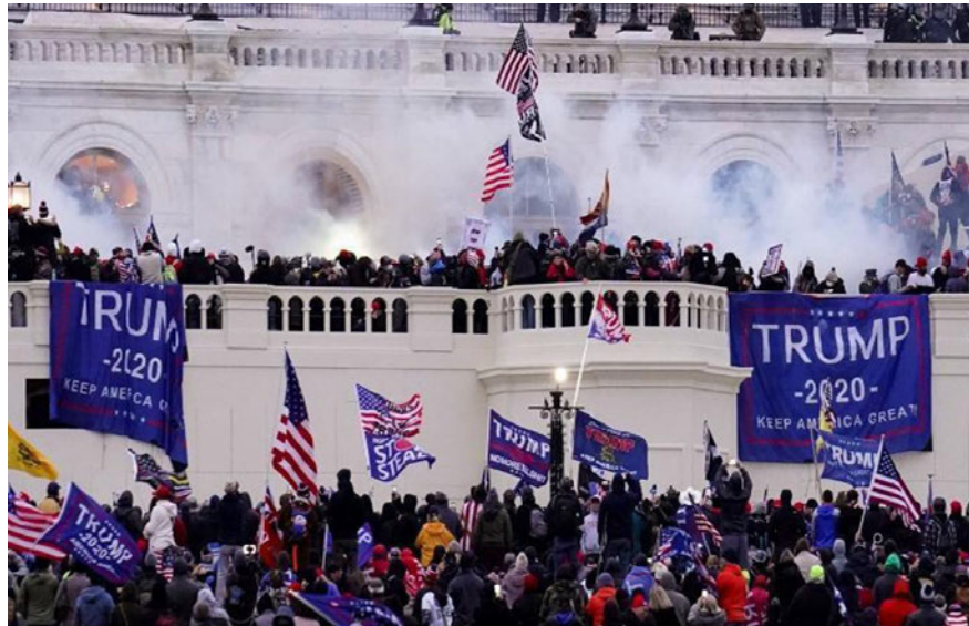
Trump’s mob attacks the Capitol