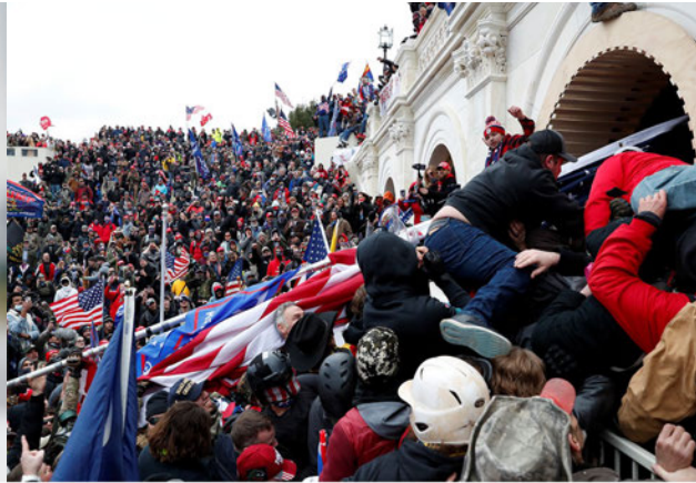
Trump's mob attacks the Capitol

11. By 1:21 p.m., President Trump knew the Capitol was under attack, and Vice President Pence had announced publicly he would not overturn the election results. While watching the assault unfold on television, Trump poured fuel on the fire. He sent a tweet at 2:24 p.m. targeting Pence for lacking the “courage” to overturn the election. The tweet caused the mob to surge and chant “hang Mike Pence!” It predictably exacerbated the violence that Trump knew was underway, something Trump knew full well would happen in response to the tweet.