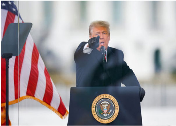
Trump addresses supporters before directing them to march on the Capitol