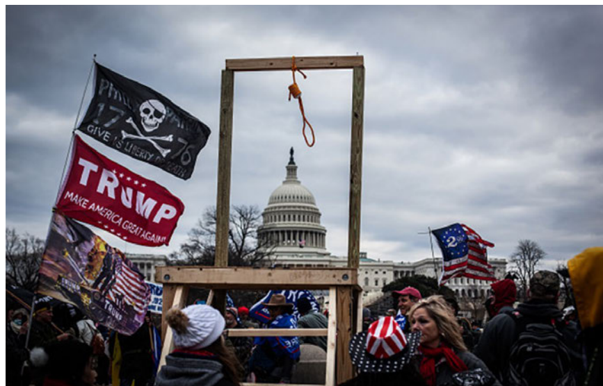
Trump's mob displays a noose and gallows on the Capitol grounds

381. The mob assembled gallows on the Capitol grounds as an intimidatory display. Later, as they stormed the Capitol building, they chanted, “Hang Mike Pence!”