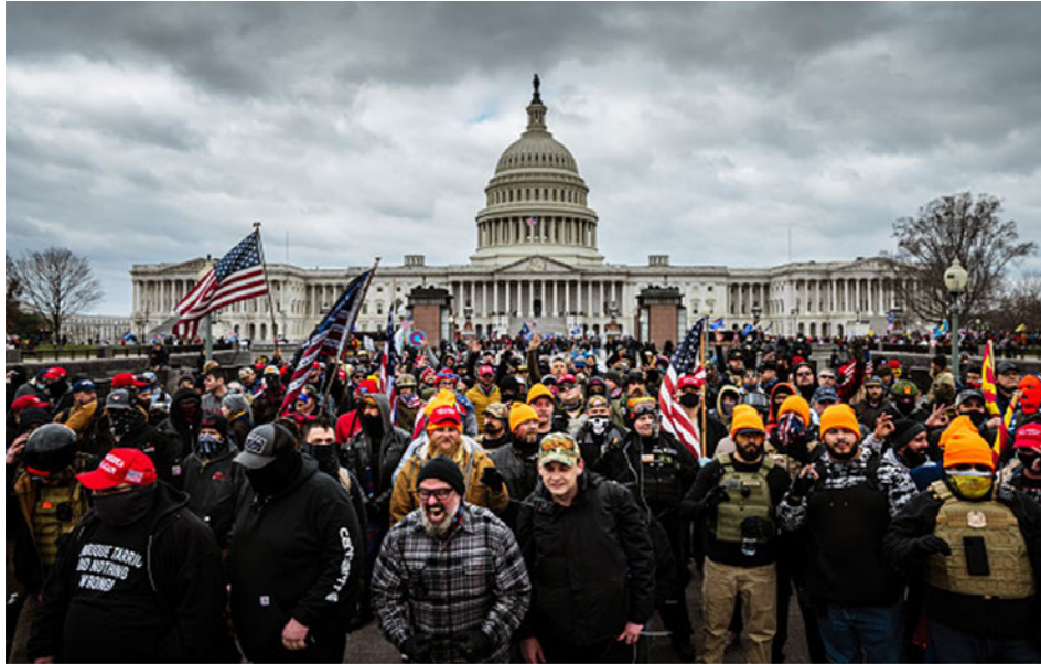
Proud Boys gather on the Capitol's East Front