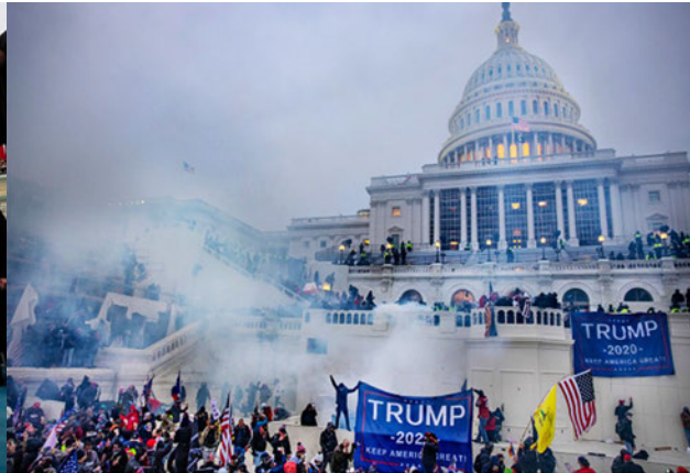
Jan. 6, 2021: Trump causes an insurrection against the Constitution

7. The core facts demonstrating Trump’s disqualification are a matter of public record. He dishonestly and unlawfully tried to overturn the 2020 election results through multiple avenues. When that failed, he summoned tens of thousands of enraged supporters for a “wild” protest in Washington, D.C. on January 6, 2021—the date that Congress and the Vice President would meet to certify the results of the 2020 presidential election under the Twelfth Amendment to the Constitution and the Electoral Count Act, 3 U.S.C. § 15.