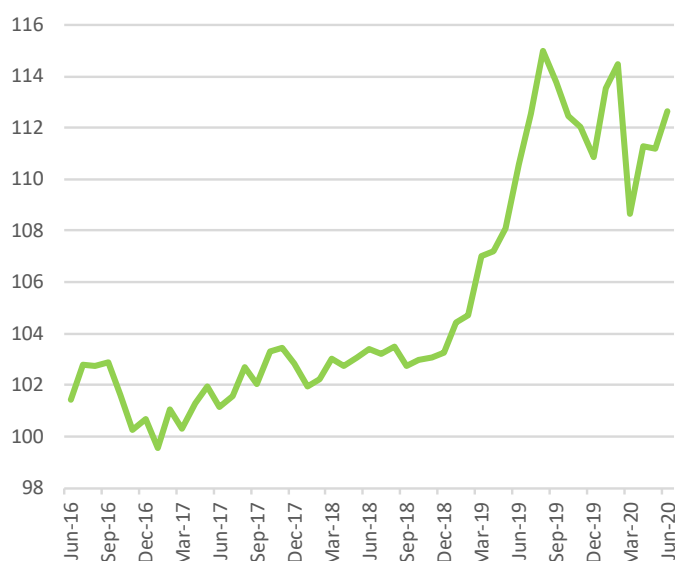
Historical Index Values - EUR Unhedged