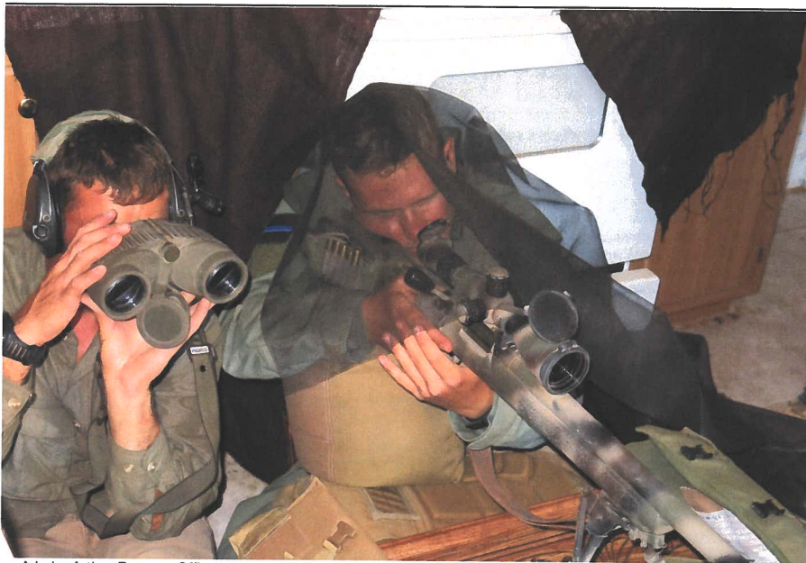
A Lake Arthur Reserve Officer and his spotter work from deep inside a structure during LE Urban Sniper Training.