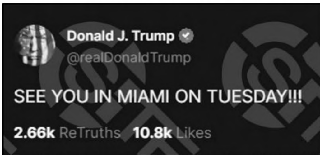
Donald Trump calling for protests in Miami on Tuesday, June 13 (June 9, 2023)

The forum post containing Trump's since-deleted Truth Social message received more than 2,000 upvotes in roughly 12 hours.